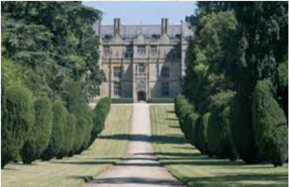
Montacute House, Somerset