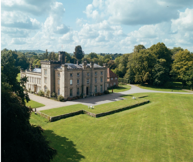
Chiddingstone Castle and Village, Kent

Thursday 24 July 2025 Highclere Castle (home of Downton Abbey)