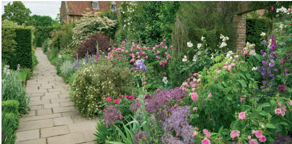
Sissinghurst Castle garden

Home and garden shaped as we see it today by Vita Sackville-West and Harold Nicholson but also lovingly and appropriately developed since 1962 by the National Trust with the creation of the vegetable garden in 2008 using the 'no dig' approach. In 2017 the South Cottage and its surrounding garden was added where the dominating colours are hot saturated shades of red, orange, and yellow. You may have visited Sissinghurst in the past, but these developments make a re-visit a must to all who have green fingers!