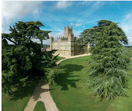
Highclere Castle, Newbury (aka Downton Abbey)

Thursday 24 July 2025 Highclere Castle (home of Downton Abbey)