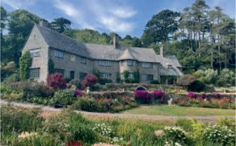
Coleton Fishacre House & Gardens

from around the world can also be found. Refreshments are available here. We return to the hotel in the late afternoon. Evening at leisure and overnight at the hotel.