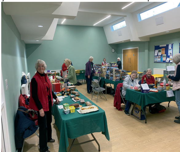
The lull before the storm! Stand by your tables, team!