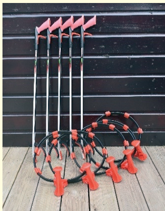
The litter pickers NTSA funded