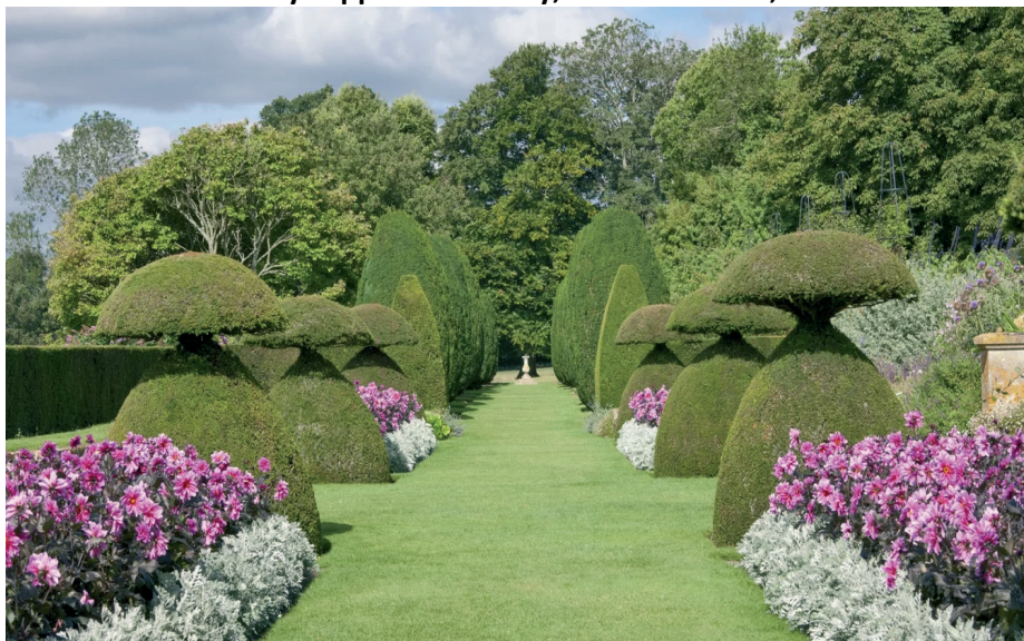
Hinton Ampner garden, Alresford, Hants (NT)