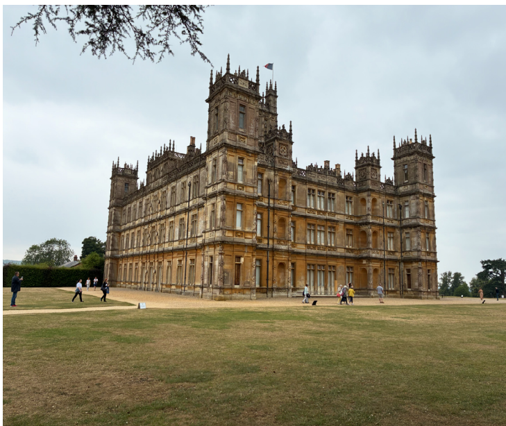
Highclere Castle, Newbury (aka Downton Abbey)

Fans of Lord and Lady Grantham and the Crawley family in general were delighted to be invited to their ancestral home only to find that it is actually the home of the Herbert family, the Earls of Pembroke and Carnarvon (no typo here!). The trouble was that we