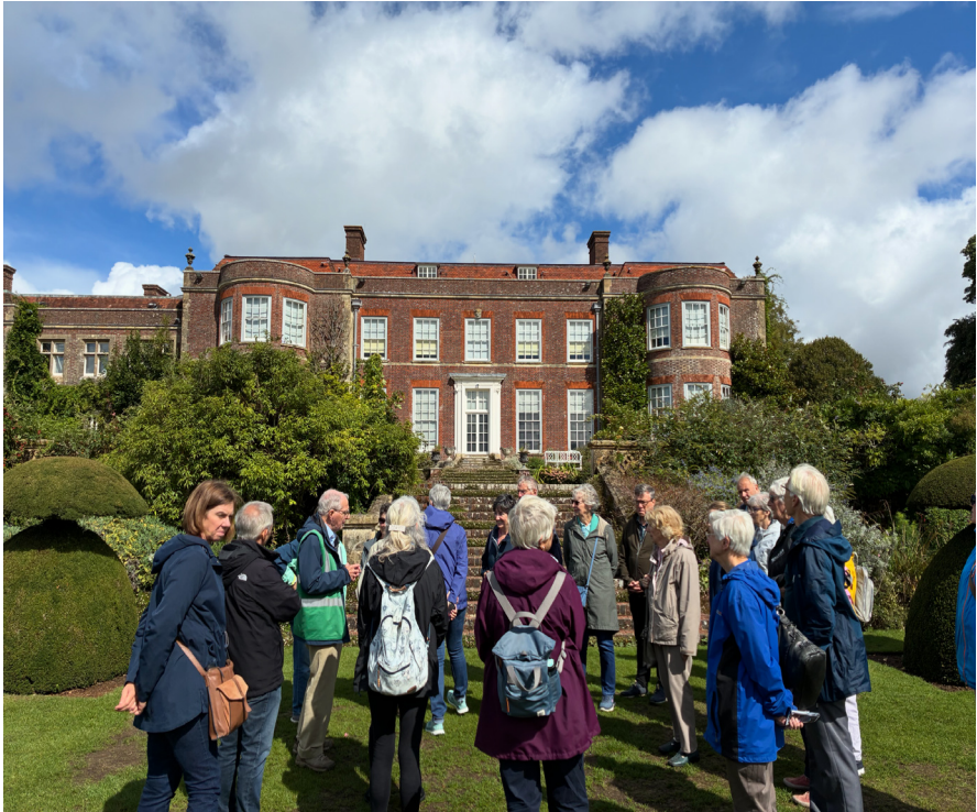
Hinton Ampner house and garden, Alresford, Hants (NT)

covered tables and cabinets within a collection of 3,547 items of ceramics and art. We could have spent the whole day there but went onto Whitchurch on the River Test,