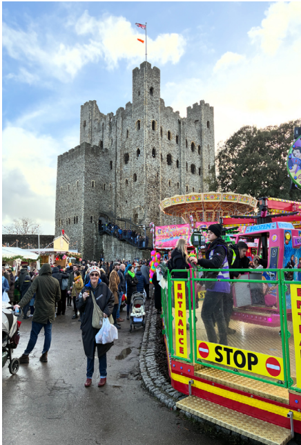
Unmistakeably Rochester Christmas Market