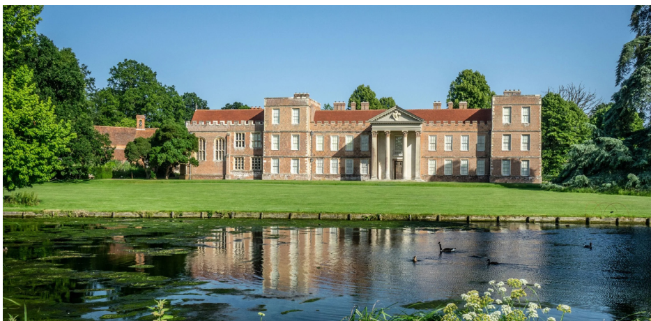
The Vyne, north façade

The Vyne was once one of the most important Tudor houses in Hampshire. For over 500 years, it was owned and shaped by just two families, the Sandys and the Chutes. Each generation enriched the property, resulting in an incredible collection and range of architecture and interiors, with the highest quality in design and craftsmanship.