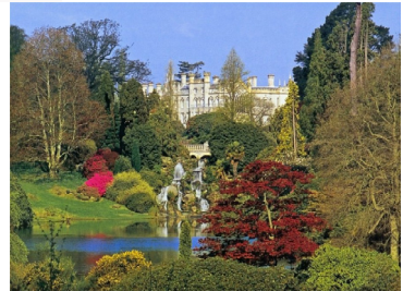
Sheffield Park cascade

Our final summer trip is to 2 lovely gardens embellished by characterful houses. Scotney has 2 castles, the old Castle was built by the Ashburnham family from 1378, and despite its military appearance, was largely for show. The Darrell family bought it in 1418, and held it until 1778 when it was sold to the Hussey family, who in turn gave it to the NT in 1970. It was Edward Hussey who commissioned Anthony Salvin to build the new castle between 1838-43. This part of the trip therefore gives us 2 properties and a wonderful garden. As if that were not enough for one day, we then travel to Sheffield Park, where we can marvel at the work of the expert gardening team as they continue to improve this Grade I Listed garden. The Coach House contains the tea room AND a bookshop AND giftshop. How better to complete a day?