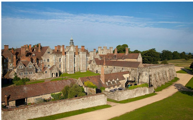
Side view of Knole showing the Royal Oak Foundation Conservation studio