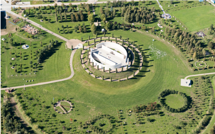
The National Arboretum