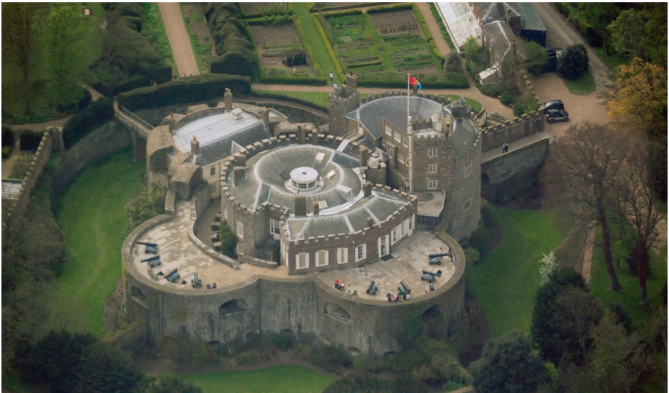
Walmer Castle from the air