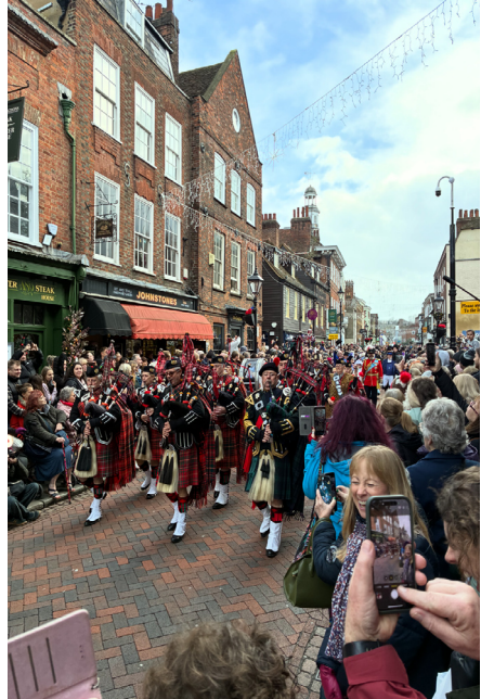
Unmistakeably Rochester's 7 Poor Travellers' Procession

characters, as well as others who just like dressing up. I don't think the Child Catcher from Chitty Chitty Bang Bang was a Dickens' creation, but Ian Fleming's evil character was there with his big net! The photo gives some impression of the lengths some people went to. Some sought peace in the impressive cathedral where Christmas carols provided an early Christmas preparation, some even climbed to the top of Rochester Castle Keep, taking in the spectacular views of the Medway towns and valley. Others queued for almost everything else- food, items from the many stalls in the Bavarian market, the chance to have a cup of lovely mulled wine fortified with brandy, or just listening to the Salvation Army band playing beautifully to create a wonderful seasonal atmosphere. It was not a place to go if the smell of the greaspaint and the roar of the crowd is not your thing, but the general feeling of all who got back on the coach was that energy had been burned, gifts bought, memorable sights seen, and another great day where the rain held off, and we could all doze off in the coach on the way home. What was great was a number of new faces on the coach, boding well for 2026.