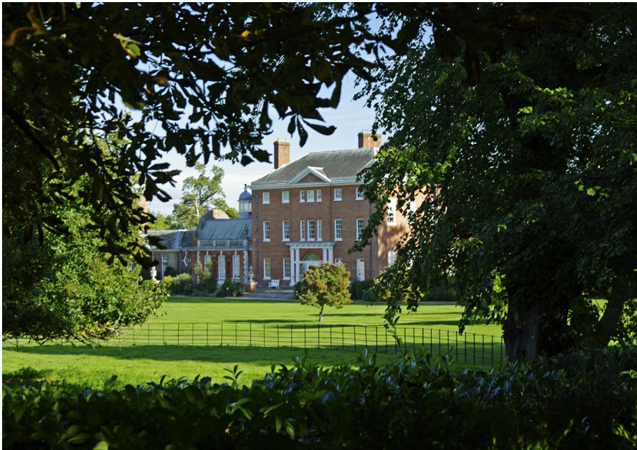
Hatchlands Park in its grounds

Hatchlands has been a family home since it was built by the Boscawens in 1756. In the years since it's filled many roles, but there's almost always been a family at the heart of the park. Admiral Edward Boscawen used the prize money from captured enemy ships to build his new home. The interior at Hatchlands Park is the earliest documented work